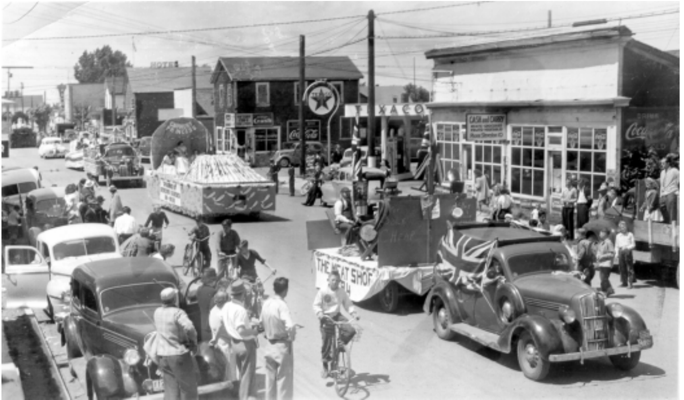
Salmon Festival Parade on Moncton Street c.1949