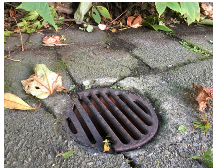
Storm drainage sewer

Sanitary and storm systems are kept separate to: